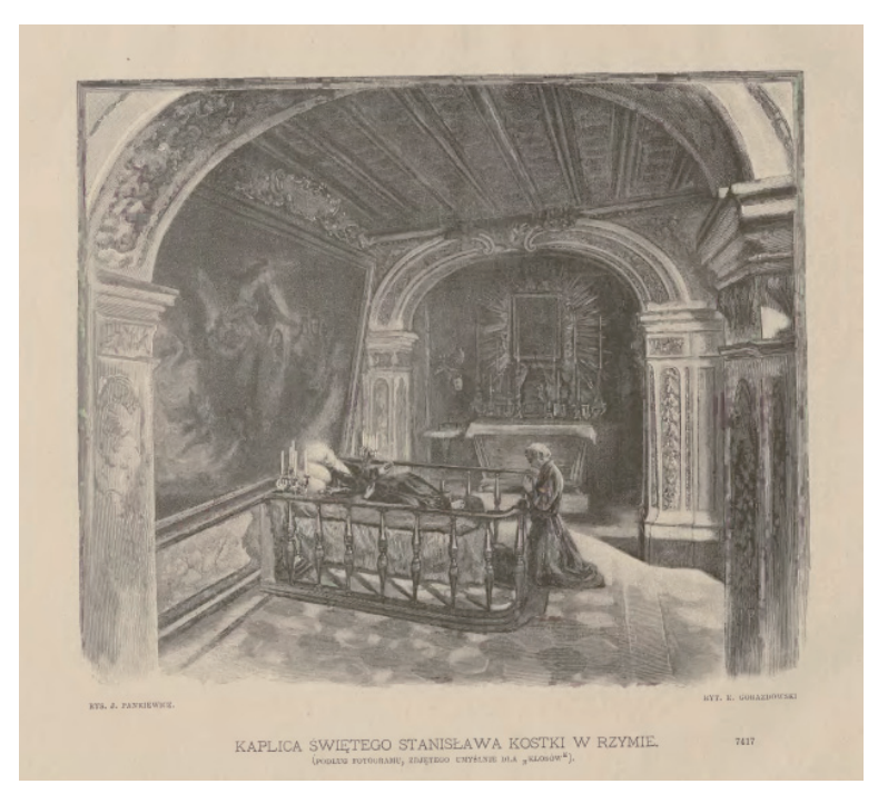
Illustration from "Kłosy" 1887 No. 1131 (of 19th February), p. 133