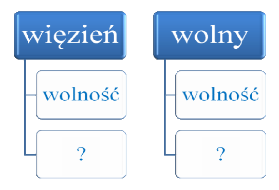
Fig. 1. Two subjects of social rehabilitation: an inmate and a free person

We have, then, two parallel subjects that remain in an interactive relation, their goal being efficient social rehabilitation. The first question that arises in interactive communication and to which an answer has to be found, is: how does a person in prison perceive reality and his situation, and how does a free person do it? Both the one and the other person say that they are free (Fig. 1). Why? What is the reason why both the subjects, although they are in different realities, say the same?