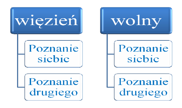
Fig. 3. Two subjects of socialization in the process of maturation

Education is transcending oneself towards truth, transcendence towards truth, a chance to cognize, a chance to correct the process of maturation that took place in the whole life up till now. This still concerns the two people who remain in interactive relations of the mentioned subjects: an inmate and a free person. The latter one also has a lot to do, even if in the sphere of the functioning stereotypes and stigmatizations (Fig. 3).