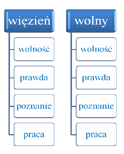
Fig. 5. Equality of subjects of socialization

identity of a man who is himself through truth – earlier cognized and accepted with an act of free will. Next the man realizes himself in freedom through this truth. It is truth that constitutes his humanity. So the identity of a man, who he is, where he comes from and where he goes, is based on the two pillars: freedom and truth.