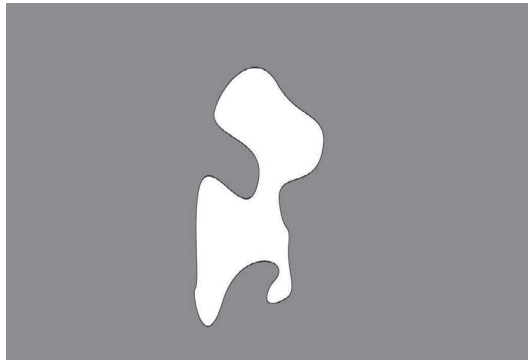
Figure 1. Sample object used in the rotation experiment.