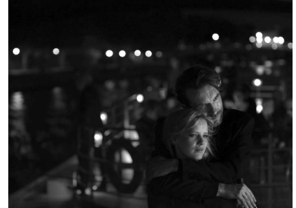
The silence during the trip on the Seine