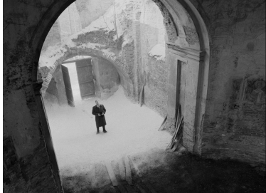
Zula and Wiktor in the Orthodox church