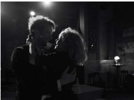
A dynamic music and dance