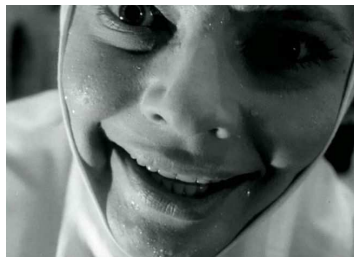
Mother Joan of the Angels J. Kawalerowicz

The nature of telling Ida is a slow narration constructed by wide and static shots, repeatability of composition, maintaining of overlaps (fragments of shots after the characters step out of the shot). Pawlikowski builds the frame space, closes it and creates the impression of non-space frame. <sup>19</sup> It creates a sort of