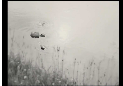
Cold War Zula in the river