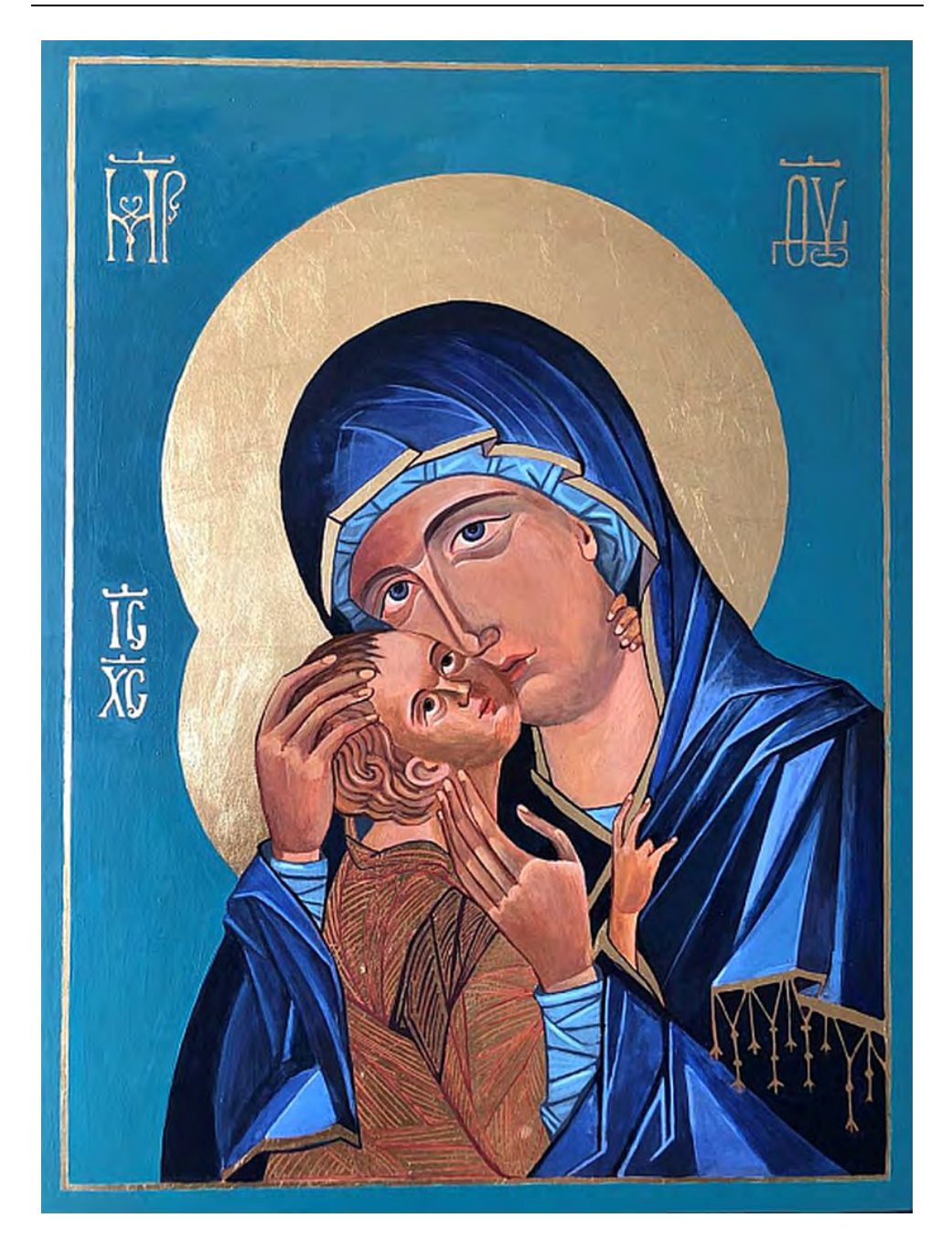
The Eleusa (2022), acrylic, golden leaf, written by Barbara Tryka on wooden board, traditionally covered with cloth and chalk (30×40 cm) (due to the author's kindness)