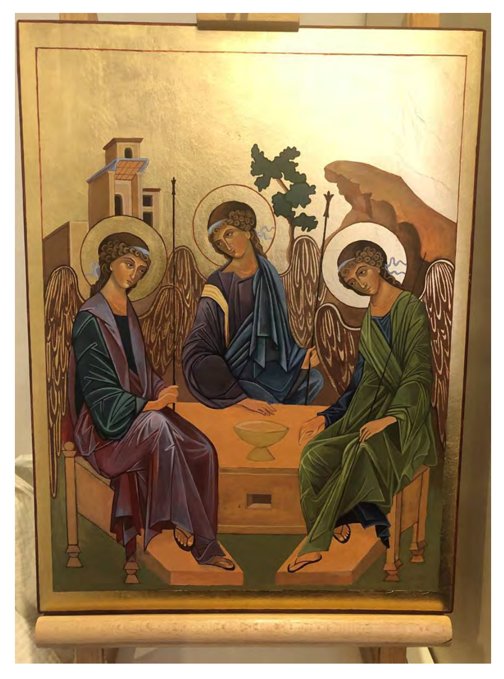
The Trinity (2022), egg tempera, golden leaf, written by Barbara Tryka on wooden board, traditionally covered with cloth and chalk (30 \times 40 \text{ cm}) (due to the author's kindness)