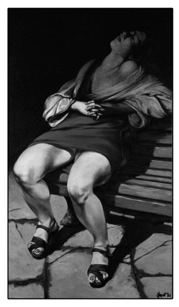
1. Zbylut Grzywacz, Woman Forlorn XI (according to Caravaggio) , 1980, oil on canvas 139.5 x 80 cm, National Museum in Kraków

The preparation of the English version of Roczniki Humanistyczne ( Annals of Arts ) and its publication in electronic databases was financed under contract no. 836/P–DUN/2018 from the resources of the Minister of Science and Higher Education for the popularization of science