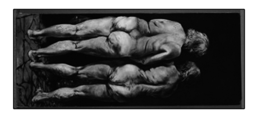
3. Zbylut Grzywacz, Queue (Seven Stages of Woman's Life), 1985, oil on canvas, triptych, 190 x 240 cm (whole), National Museum in Wrocław