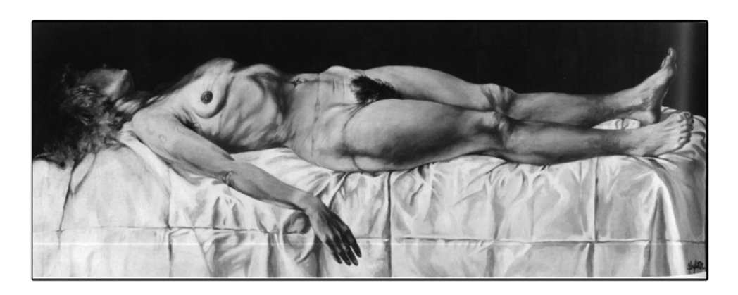
4. Zbylut Grzywacz, Woman\ Lying (from the Spring'82 cycles), 1981–1982, oil on canvas 70 x 190 cm, in private collection