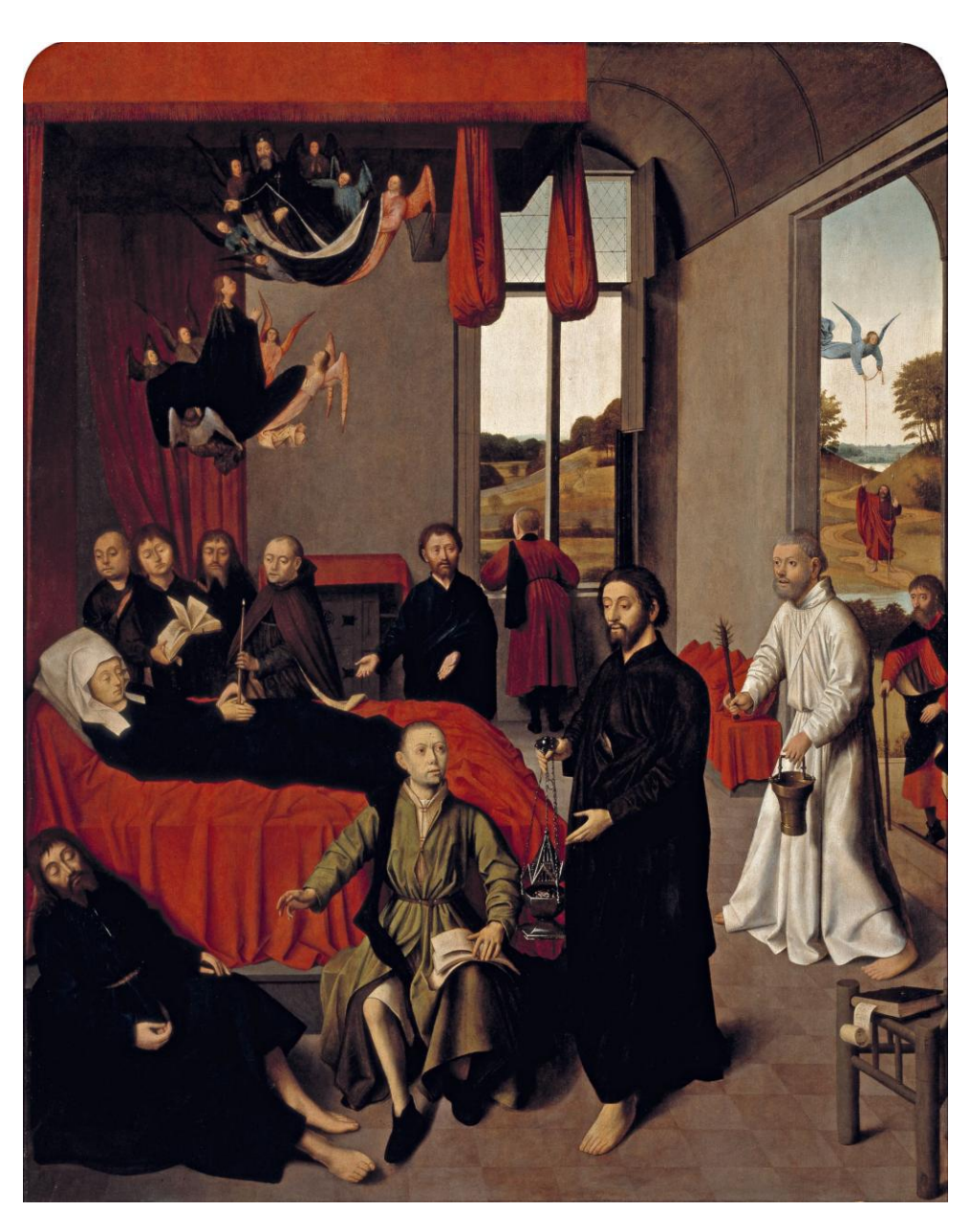
4. Petrus Christus, The Dormition of Mary , oil, panel, ca. 1460–1465, San Diego, The Timken Museum of Art.