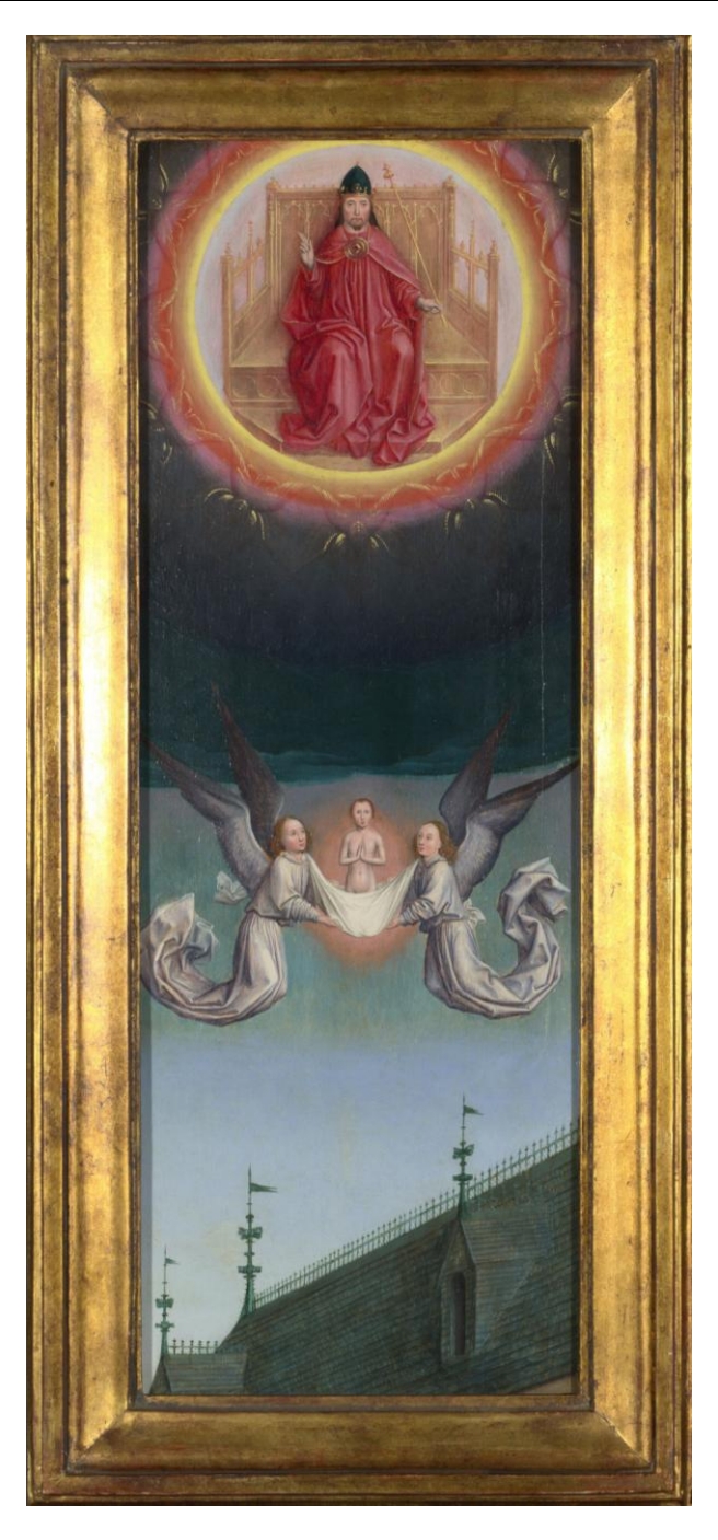
5. Simon Marmion, The Soul of St. Bertin Carried up to God —wing of the Altar of St. Bertin , oil, panel, ca. 1455–1460, London, The National Gallery.