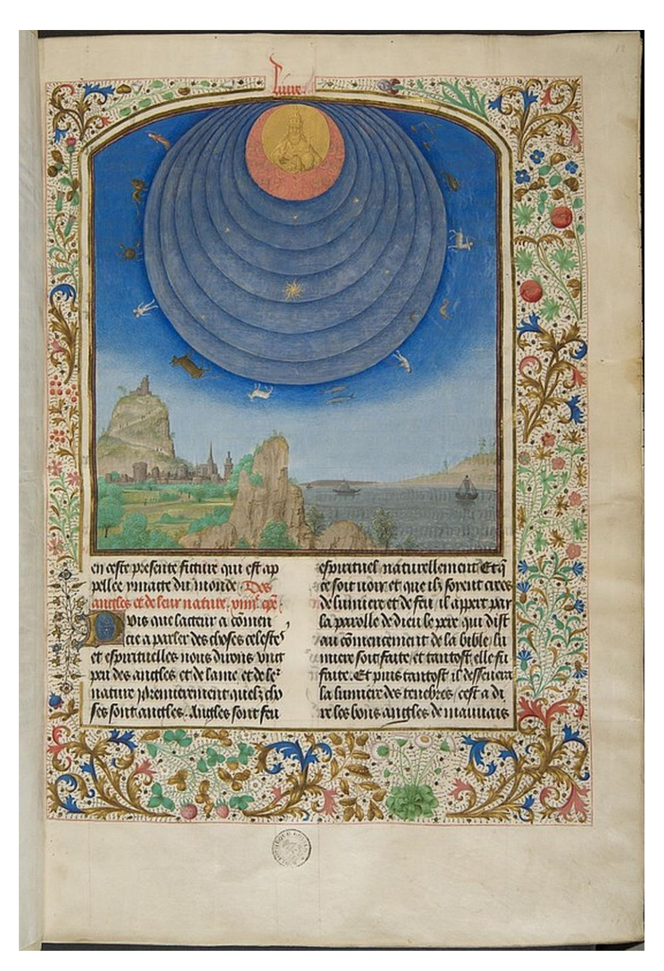
3. Simon Marmion, God Amidst Heavenly Spheres, Le livre des sept âges du monde , ca. 1455, Brussels, Koninklijke Bibliotheek van België, Ms. 9047, fol. 12r.