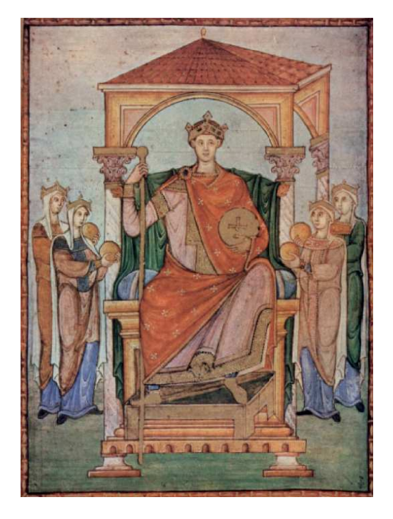
1. Otto II, Registrum Gregorii (Chantilly, Musée Condé, MS 14 chart excluded).