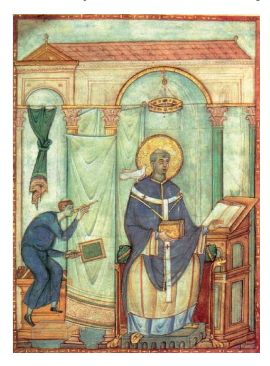
5. Gregory the Great, Registrum Gregorii (Trier, Stadtbibliothek, MS 171/1626).

4. Otto III and personifications of lands, 0v, 1r Evageliary, (Bamberg, Staatsbibliothek, Class. 79).