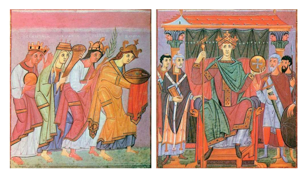
3. Otto III and personifications of lands, 23v, 24r, so-called Gospels of Otto III (Munich, Bayerische Staatsbibliothek, Clm. 4453).