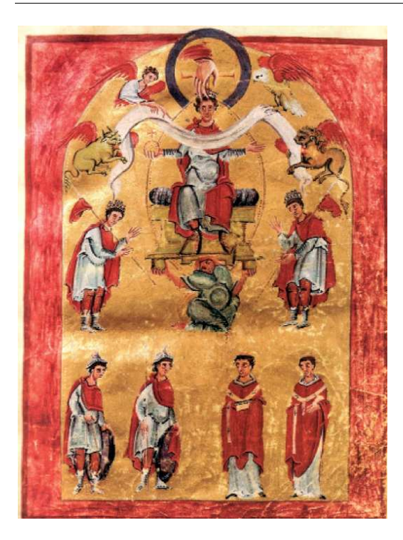
2. Otto III, Liuthar Gospels 16r, called Aachen Evangeliary (Aachen, Domschatz).