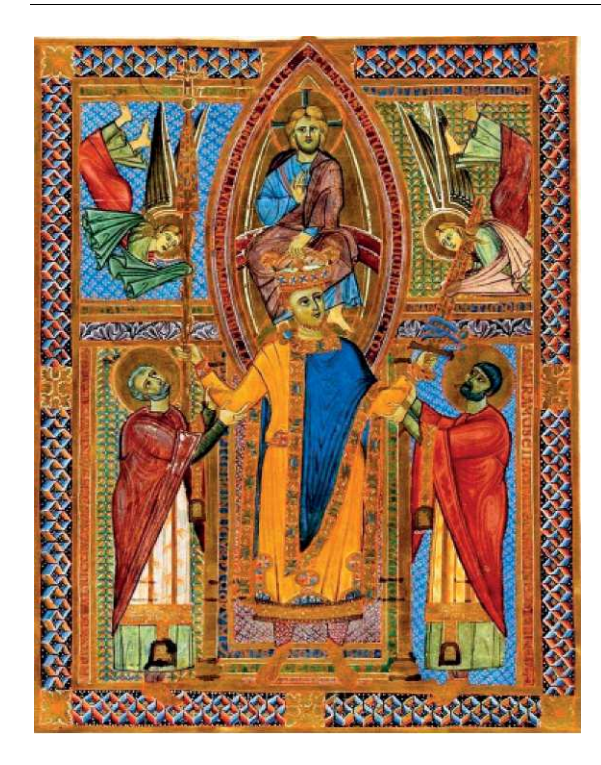
6. Christ crowning Henry II, 11r, Sacrament Book of Henry II, 1002–14 (Munich Bayerische Staatsbiblithek, Clm. 4456).