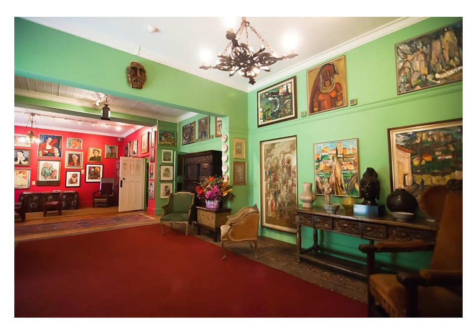
7. Interior of the Irma Stern Museum in Cape Town, 2018