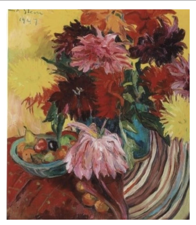
6. Irma Stern, Dahlias , 1947, oil on canvas, 96x84 cm, Private Collection