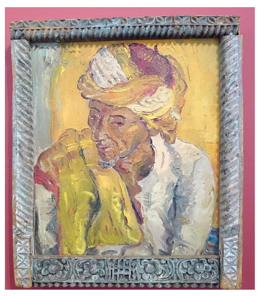
4. Irma Stern, The golden shawl , 1945, oil on canvas, 65 x 53 cm, Iziko, National Gallery, Cape Town