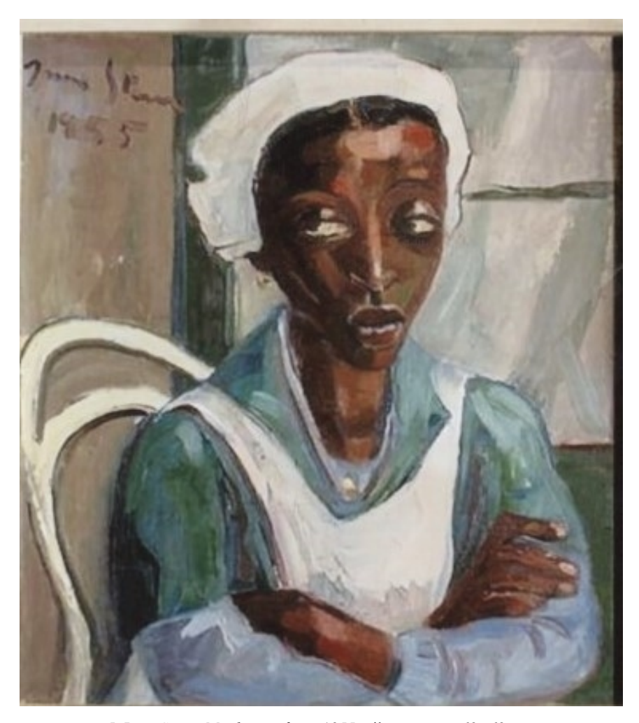
5. Irma Stern, Maid~in~uniform,~1955,~oil~on~canvas,~69\times63~cm, Irma Stern Museum, Cape Town