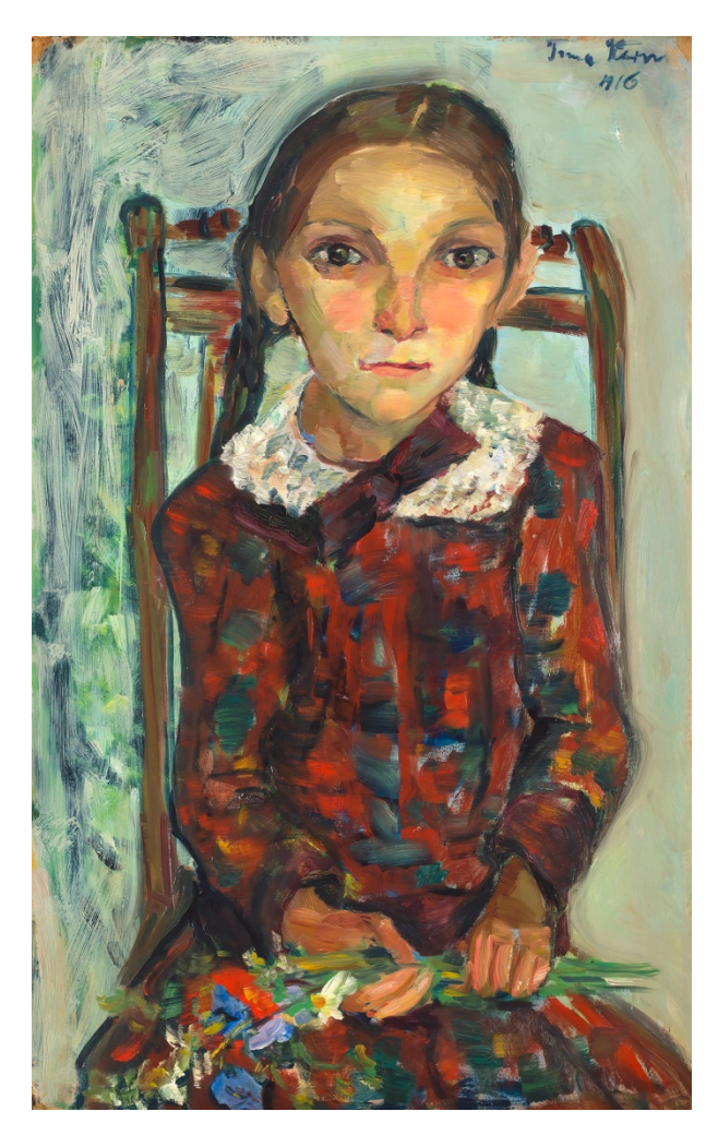
1. Irma Stern, The eternal child , 1916, oil on board, 72.5×42 cm, Rupert Museum, Stellenbosch