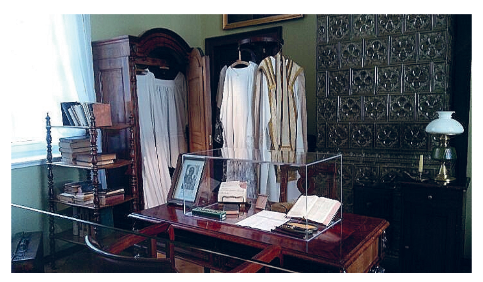
Photo 1. Room of Fr. Stefan Wyszyński in Kozłówka